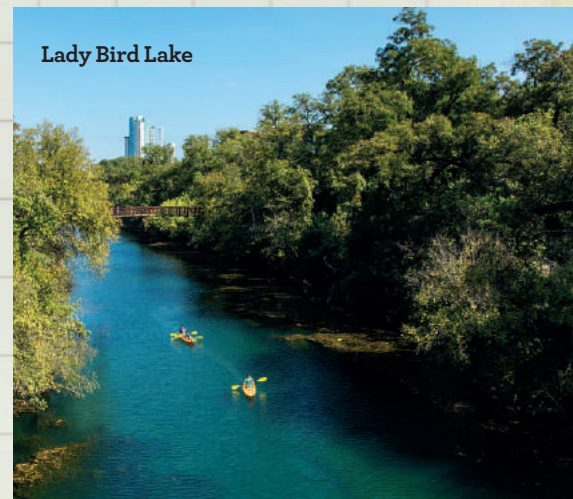
Lady Bird Lake

A hive of creativity and culture, this colourful, laid-back city's 'Keep Austin Weird' slogan reflects its commitment to promoting and supporting small businesses. The result is a strong independent feel, with locally owned cafés, bars and restaurants. It's also the Live Music Capital of the world, with more live music venues per capita than anywhere else.