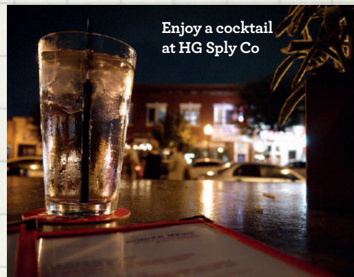
Enjoy a cocktail at HG Sply Co

This buzzy corner to the east of the city is a great spot for an evening of people-watching and cocktail-sipping. Head to Truck Yard for a cold beverage in a quirky outdoor space. For more wholesome fare, try HG Sply Co, a paleo-inspired restaurant serving healthy food in a lively setting. The drinks menu includes strawberry peppercorn gin and cucumber smash. hgsplyco.com ; truckyarddallas.com