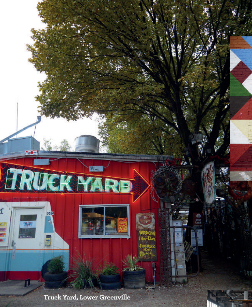
Truck Yard, Lower Greenville

Dallas is full of Instagrammable wall art