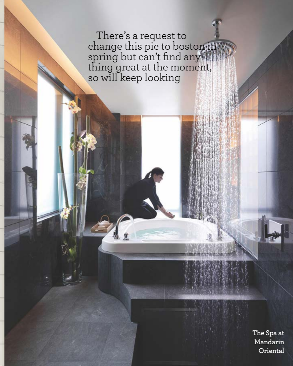
The Spa at Mandarin Oriental

If you really feel like stretching your legs, there's a 50-mile waterside walk that will take you through vast swathes of maritime Boston. But if time and energy levels are limited, focus on the Downtown and North End sections to enjoy the city's bustling waterfront – perfect for people-watching locals and tourists alike! If you're unlucky with the spring weather, there's plenty of cafés and watering holes to escape from the elements, too.