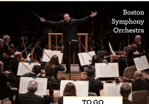
Boston Symphony Orchestra