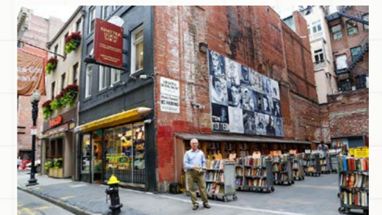
Brattle Book Shop

The city's oldest gallery and museum is home to over 450,000 works of art, so you'll need the best part of a day to enjoy it in all its glory. There are regularly changing exhibitions, ranging from paintings, artefacts, antiquity, photography, jewellery and textiles, that sit alongside some of America's most impressive full-time displays – including the greatest Monet exhibition outside of Europe. It also hosts regular events such as yoga and live music performances. mfa.org