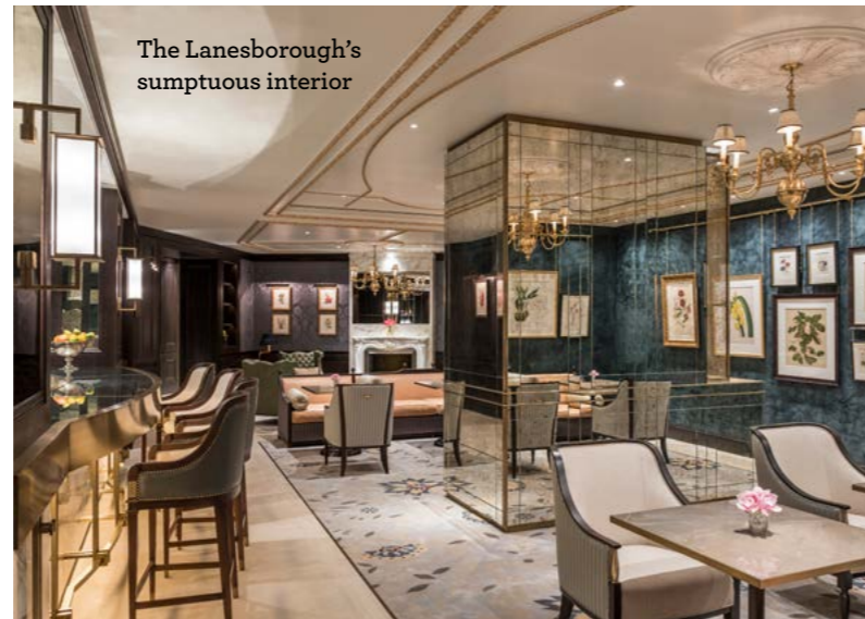
The Lanesborough's sumptuous interior