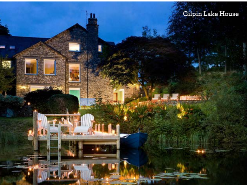
Gilpin Lake House

Gilpin Lake House is available from £445 per night on a B&B basis. Treatments at the Jetty Spa cost from £75. The three-hour Jetty Spa Trail is £100 per person. thegilpin.co.uk